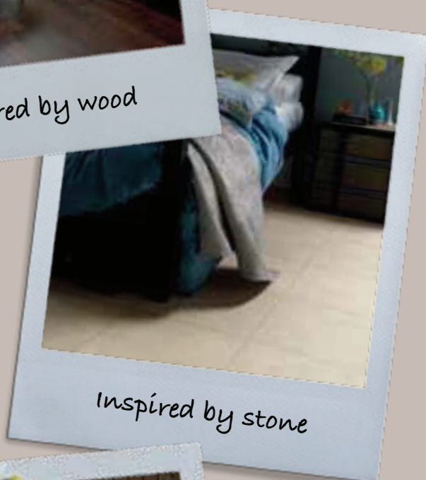
Inspired by stone