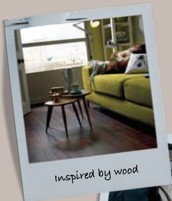
Inspired by wood